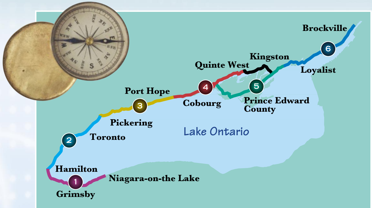
Lake Ontario Waterfront Trail and Greenway Map

Travel the beautiful Lake Ontario Waterfront Trail and Greenway with six suggestions for easy-to-follow Bicycle Tours